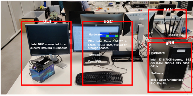
Fig. 2: Real-world Testbed.

(AMF), Session Management Function (SMF), and Network Slice Selection Function (NSSF), and the data plane element i.e., User Plane Function (UPF), are deployed on separate Virtual Machines (VMs). This decentralized approach simplifies the management and orchestration within the 5G SA network and enables Network Slicing by creating multiple UPFs, as shown in Figure 1. Each slice is identified by the SST and SD value pair, which defines i) the logical network and ii) the type of slice i.e., eMBB, URLLC, and mMTC. Each pair of SST and SD are identified by the User Equipments (UEs) using a specific Data Network Name (DNN). Furthermore, each UPF is deployed on its own VM, hosted in a different data center. This guarantees that slices do not use the pool of computing resources dedicated to other slices, and enables the application of different network policies per slice.